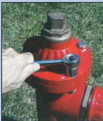
UNDO 4 BOLTS