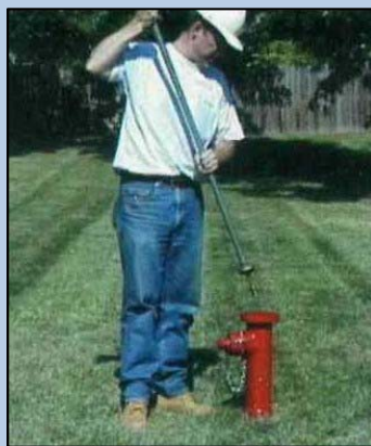
PULL OUT ROD