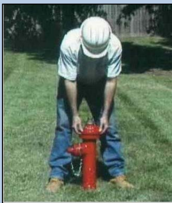
PULL UP TOP CAP