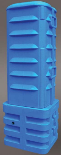
UV Resistant Enclosure