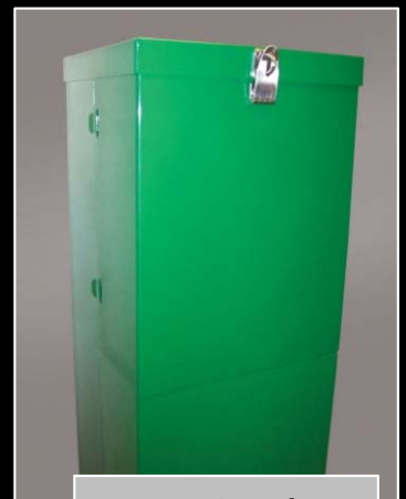
Optional Lockable Powder-Coated Steel Enclosure