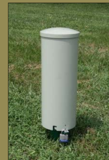
Optional Plastic Enclosure