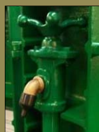
Protective Caps On All Outlets