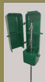
Eclipse #88-SS Stainless Steel Model Also Available