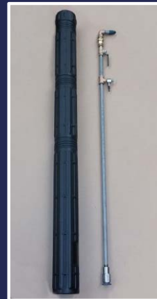
Sampling Rod & Case Sold Separately