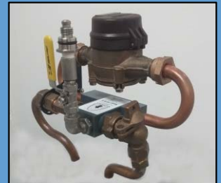
As shown with #95WM installed in setter with meter reset