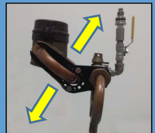
Horns not only adjust but can be locked into place