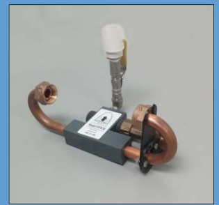
Protective cap keeps sampling tap clean