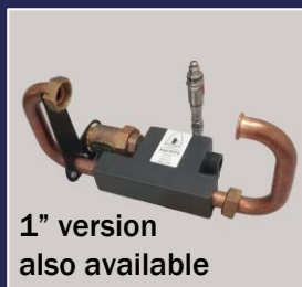
1" version also available

3/4" threaded sampling point for easy connection and elimination of leaking as with quick disconnect models