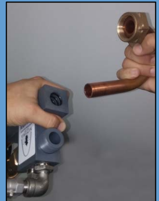
Removable horns fit securely into water tight triple O-ring slip joint