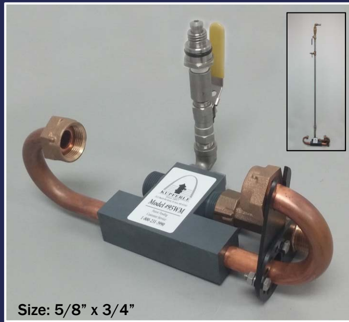
Size: 5/8" x 3/4"